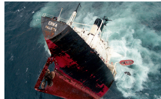
Sinking of Tanker Erika, 1999